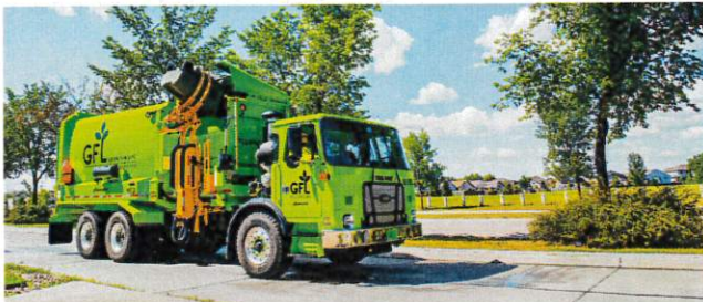
10% post-consumer recycled paper

Local clean sweep programs may offer alternative options for disposal of fluorescent light bulbs, household hazardous waste, pharmaceuticals, and electronics.